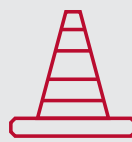
OCCUPATIONAL HEALTH & SAFETY