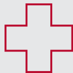
MEDICAL CENTER SAFETY & EMERGENCY PREPAREDNESS