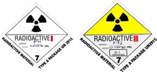
White I and Yellow II package labels

* All White I and Yellow II packages must be surveyed within 3 hours of receipt by the receiving department. Excepted packages do not need to be surveyed. Take a smear wipe of the exterior of the package including all six sides covering a minimum of 300 cm 2 . Divide the total dpm from the counter results by 300 to get the dpm/cm 2 result. The results must not exceed 2.2 dpm/cm 2 for beta and gamma emitters. If survey results exceed the above limits, call Radiation Safety at 614-292-1284. (from OARDC 8-2-1284).