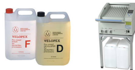
SPENT FILM PROCESSOR CHEMICALS AND RINSE WATERS